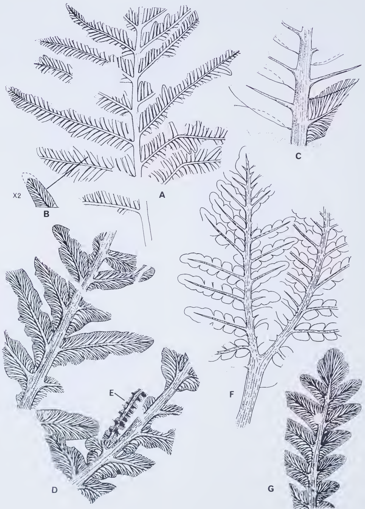
Figure 2. Fossil fern, lycopsid and seed ferns from Culvida Soak; A, B, Cladophlebis carnei (F9160); C, G, Dicroidium narrabeenense (F9154, F9149 respectively); D, Dicroidium hughesii (F9155); E, Cylomeia undulata (F9155); F, Dicroidium zuberi (F9144).